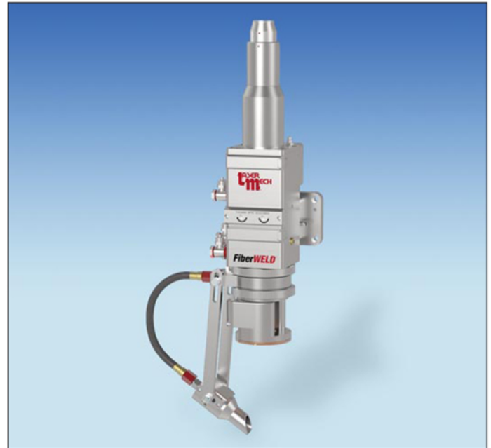
Laser Mechanisms' rugged FiberWELD® is engineered to withstand the harshest production welding environments.