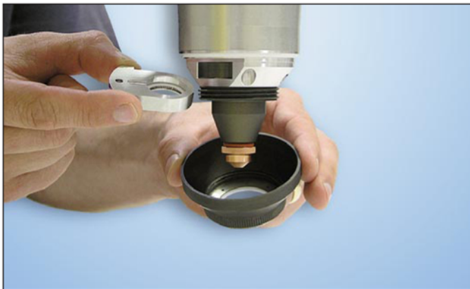
Cartridge style drawer provides quick and easy access to the cover glass. Cleaning and replacement requires no tools and can be performed in a matter of seconds.