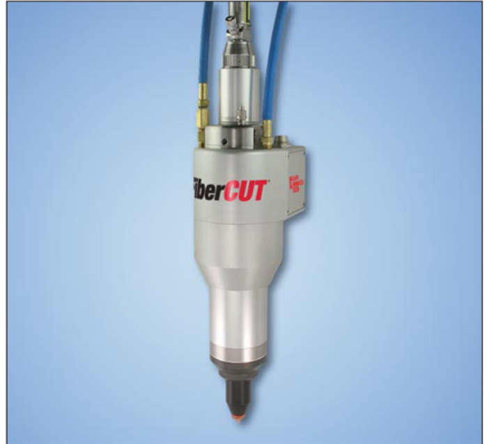
By locating all wiring and assist gas lines within the head, the potential for downtime due to snags and breaks is virtually eliminated.