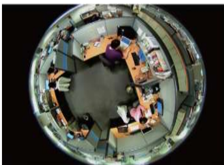
360° Source View