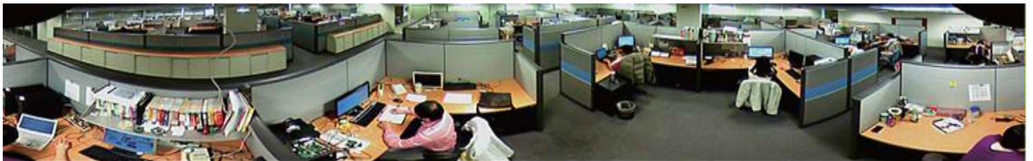
360° Broad View