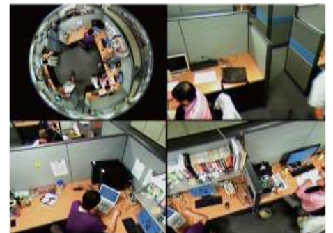
3 PTZ with Source View