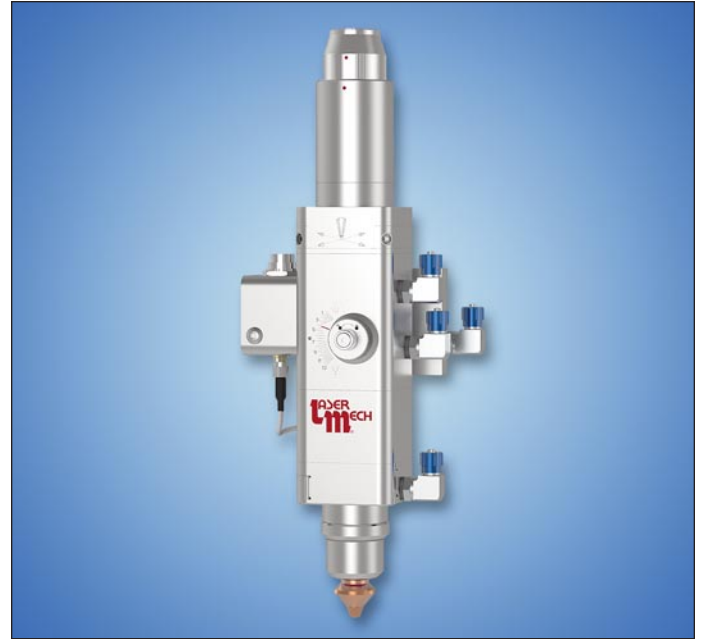
Laser Mechanisms' ultra-compact FiberMINI® ST easily integrates into modern, three-axis laser cutting machine designs.