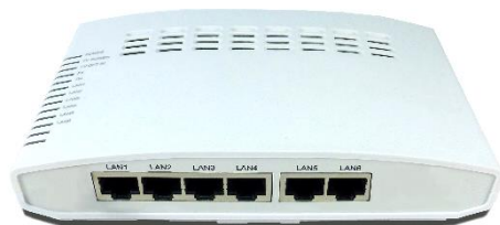
(Without Fiber Tray)