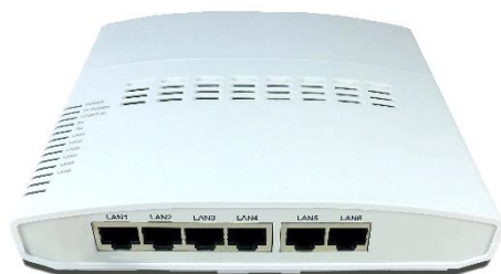
(With Fiber Tray)

The ASWS-9T7W-xxxxx-xx is a very compact manageable Gigabit Ethernet layer 2+ Switch with one Gigabit fiber port and seven Gigabit Ethernet LAN ports and a RF output connector. This Switch with its patented functions is unique due to its ability of selecting either 100Mbps -or- 1Gbps on the fiber port, using the 1x9 module or SFP.